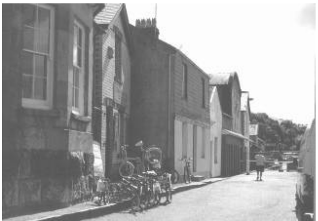
Caernarfon's Harbour Trust is seeking to demolish this entire group of buildings, industrial and residential

The buildings form an attractive group of industrial buildings, and are located within a conservation area, as well as being right next to a World Heritage Site, and next to the Grade II* listed Harbour Offices. They are surviving examples of the growth of the town in the 19<sup>th</sup> century and of the then thriving slate industry. Their charm lies in the way they form a part of the townscape, providing a visual link between the more formal Georgian and Victorian houses of the town and the harbour.