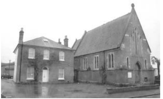
The former church and presbytery of St. Joseph's, Christchurch, threatened with carparkification.

The Church's own internal system states that the Bishop may allow a church to be used for secular purposes if agreed by the Council of Priests and the Historic Churches Committee, (Canon #1222 and paragraph 47 of the Directory on the Ecclesiastical Exemption from Listed building control). The advice of these bodies is to demolish the building, and so the Bishop is prepared to grant a decree to demolish, but not to offer it for sale on the open market or for guidance some alternative use (as secular demands). This in itself is not a reason to demolish indeed the internal decision making processes of any organisation, church, state or private enterprise should have no bearing on the outcome of the planning system.